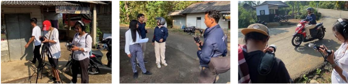
Figure 4. Video Shooting Process

local representation. The regional accent was deliberately maintained to strengthen the authenticity and create an emotional closeness between the narrator and the audience. The narrative script that has been compiled is read with calm and expressive articulation, blending harmoniously with the background music which is also the result of the choice of the residents, namely a blend of traditional and modern instruments with soft nuances. The entire shooting session was carried out in accordance with the storyboard sequence that had been designed together, starting from shooting at the village gate, then continuing to agricultural activities, MSME production, to scenes that record the cultural wealth and social interactions of residents as a form of vibrant and dynamic community life.