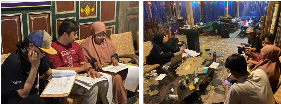
Figure 3. Preparation of scenario and story board

team facilitated a limited group discussion consisting of youth leaders, representatives of MSMEs, village officials, and PKK mothers to formulate the main visual elements to be displayed in the video. The results of the discussion determined five main shooting locations that were carefully selected based on their aesthetic value as well as their symbolic meaning. The village entrance gate was chosen as a symbol of openness and welcome, the people's coffee plantation represents the spirit of mutual cooperation and agrarian productivity, the chip production house reflects the independence of the local economy, the village hall illustrates the center of services and community interaction, and the local cultural procession is a form of tradition preservation. The selection of these points is intended to represent the identity of Pait Village as a whole and down to earth.