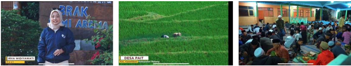
Figure 6. Video Profile of Pait Village

only represents the potential of the village, but also strengthens the collective identity and pride of its residents.