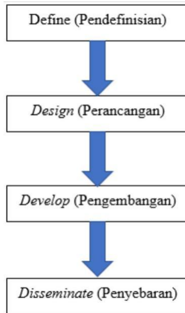
Figure 1. 4D Development Model