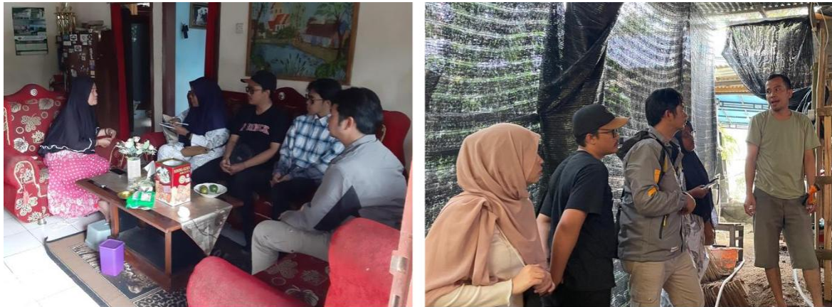
Figure 2. Observation process with traditional leaders and UMKM

In response to the initial findings, the service team facilitated a participatory discussion forum involving various elements of the Pait Village community. This forum became an inclusive and productive dialog space, where high enthusiasm was shown by the village government and residents towards the idea of making a village profile video. The hope is that this video will not only serve as an external promotional medium, but also be able to represent honestly, proudly and authentically the village's rich local potential. During the discussion, a number of excellent potentials were identified that reflect the unique character of the village, such as the community coffee plantation that is managed in mutual cooperation, the production of cassava chips by the women's group, and cultural practices such as the village celebration tradition and hadrah performances. A collective realization also emerged that well-designed visual media could be a strategic tool to introduce the village to a wider audience while strengthening cultural identity and a sense of belonging among its residents.