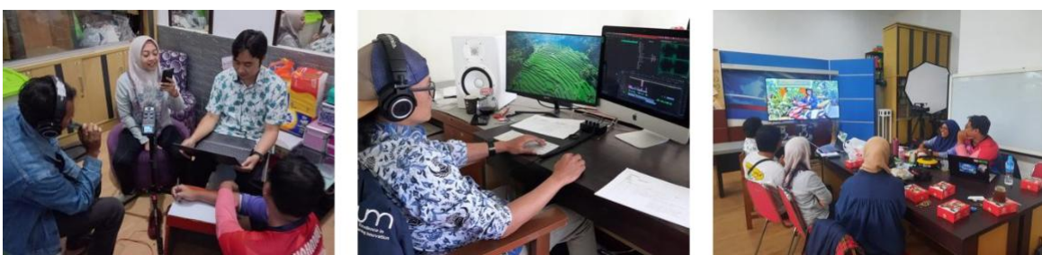
Figure 5: The Process of Dubbing, Editing, And Reviewing the Video

After the entire shooting and initial editing process was completed, the video in draft form was presented in a limited trial forum involving various elements of the community. The forum was attended by representatives of farmer groups, PKK women, youth organizations, and village officials, who collectively represented the voice of the Pait Village community. This session became an evaluative space that was utilized to gather direct feedback from the community, both in terms of the technical and substance of the video content. Various inputs were constructively conveyed, including the need to adjust the volume of the narration to be more balanced with the background music, the alignment of visual transitions between segments to be smoother, and the addition of footage featuring village youth activities in digital technology training and entrepreneurial activities as a representation of the dynamics of the progressive younger generation.