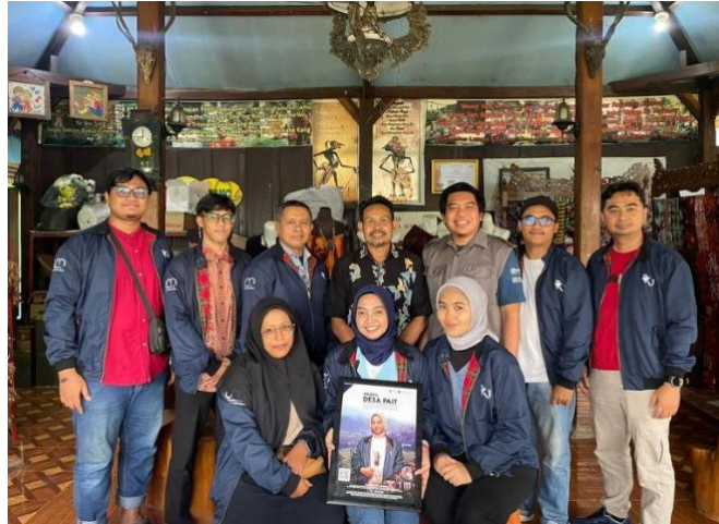
Figure 7. The Process of Submitting Profile Videos To The Village Government

Thus, the Disseminate stage does not merely result in the publication of content in the form of profile videos, but also opens up space for wider and strategic utilization in various aspects of village development. The video serves as an effective communication tool to reach external partners, strengthen the village's bargaining position in program proposals, as well as an educational medium in training residents, especially the younger generation. The video also strengthens the image of Pait Village as a community that is adaptive to technology, creative in expressing local identity, and ready to build cross-sector cooperation networks. The long-term impact of this dissemination process lies not only in the existence of the content, but also in how the content triggers social transformation, empowerment and potential-based development from within the community itself.